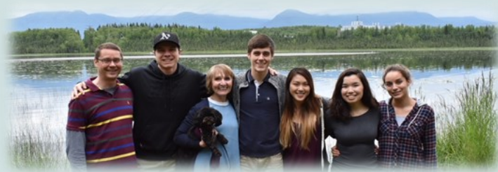
Summer Scholars 2017, Anchorage, AK