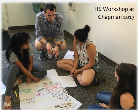
HS Workshop at Chapman 2017