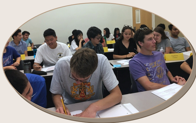
High School Workshop at Chapman

In the last week of July the interns served as mentors to three high school teams who built a virtual world experiment in the annual IFREE/CSN High School Workshop.