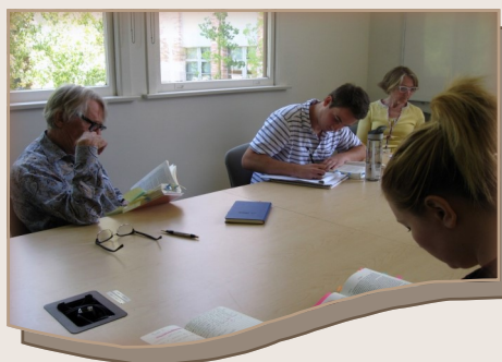
2016 Summer Scholars

The 2016 Summer Scholars Program at Chapman University’s Economic Science Institute (ESI) was jointly funded by the Thomas W. Smith Foundation and IFREE.