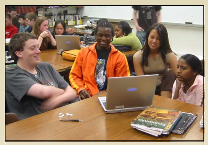
Student's at University of Anchorage Alaska workshop gather around a laptop to examine an experiment.

oil, coal, timber, and minerals, Alaska is home to some of the wildest beauty on earth. The delicate and difficult balancing act this entails is at the heart of frontier economics and constitutes an economic dialogue in which I cannot wait to participate.